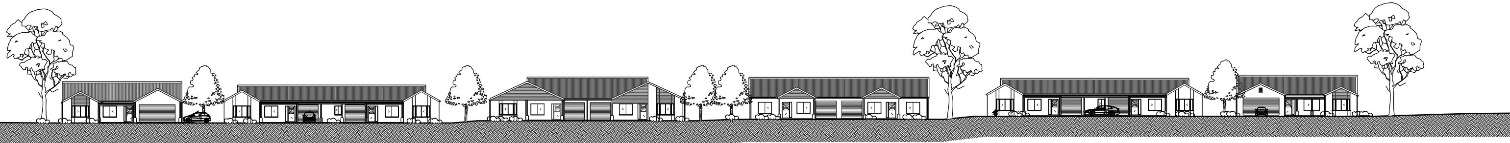
TYPICAL STREET SCAPE ELEVATION 1:200