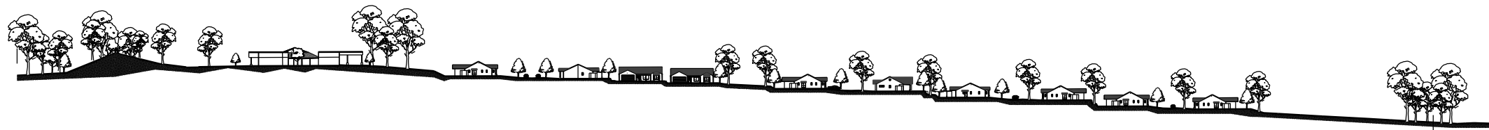
2 2.06 SECTION THRU SITE LOOKING NORTH